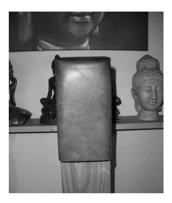
... and have a leather-covered foam pad instead of the traditional rice-straw striking area