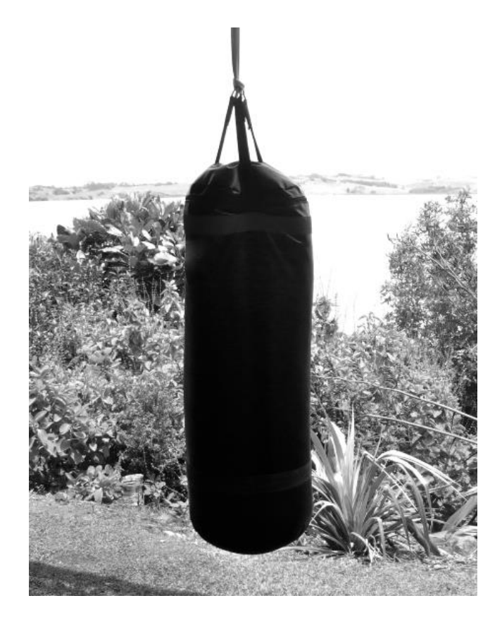
A heavy hanging bag is a useful supplement to the makiwara

A valuable supplement to the makiwara is a heavy hanging bag. The chief advantage of the bag is that it can be hit from a wide variety of angles and hence used in combination with realistic footwork. Also, because it can swing towards you and "oppose" you, it will give you a kind of instructive experience different from what is obtainable from the static and relatively rigid makiwara. You can in a certain sense spar with it. In addition, the bag can be used to train kicks much more satisfactorily than the post-mounted makiwara can, though one sometimes sees a lower pad attached to a makiwara post and used for a limited form of kicking practice.