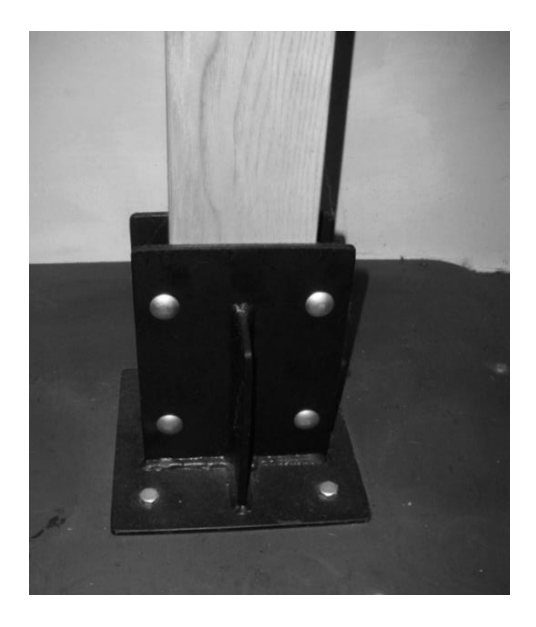
Makiwara posts are nowadays more often bolted to the floor indoors by means of a metal bracket ...