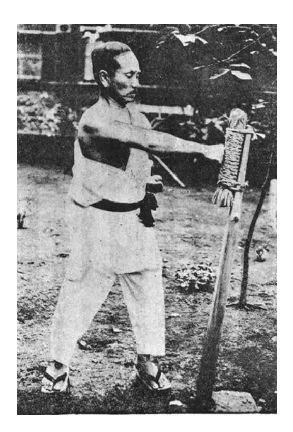
The older type of makiwara post was buried in the ground and bound at the top with rice-straw to form a striking surface. The karateka in the picture is Funakoshi Gichin

It is of course not necessary to feel bound to any one design or pattern. There is no reason why the individual should not design training aids to his own specification and make them out of whatever materials come to hand. We have seen striking posts made along the lines of the Wing Chun or Choi Li Fut "wooden man," with various projections added to represent arms and legs; we have seen makiwara made out of old rubber tyres, pieces of carpet, and so forth. There are no limits to human inventiveness; and this is, after all, quite in keeping with the time-honoured Okinawan practice of improvisation using everyday objects.