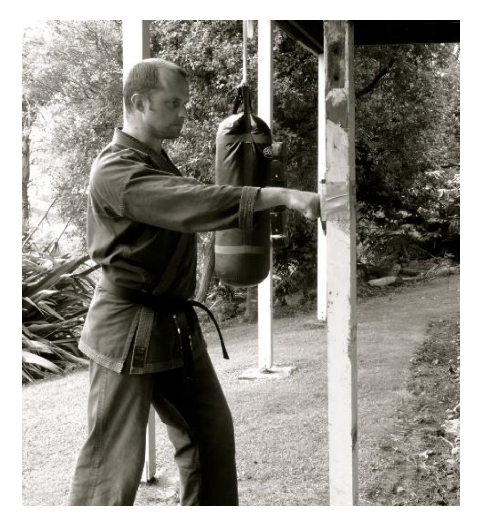
Another variation on the makiwara theme

purpose do not, in our experience, have much to be said for them; but there is no harm in trying them. You will probably find that the skin of your knuckles will break and bleed initially, and you should not apply anything toxic (e.g. arnica ointment) or astringent to broken skin. It used to be said that the rice straw of which makiwara were traditionally made has antiseptic properties, but we know of no reason to think this true.