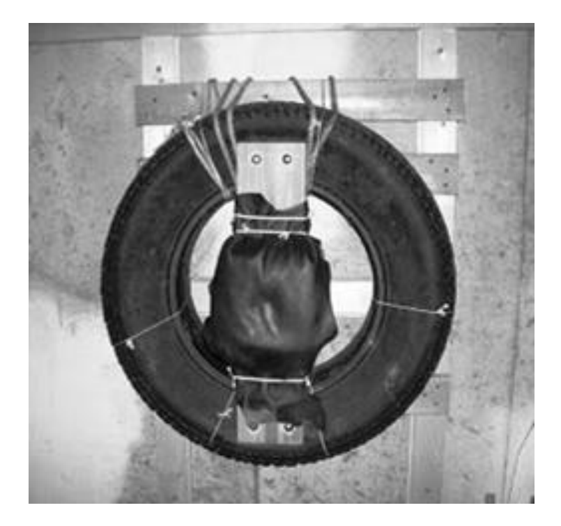
There is no reason why the individual should not design training aids to his own specifications and use whatever materials come to hand

Practice with the makiwara has two great advantages. Because the striking area is so small, each strike has to be very accurately focussed. (It is, we point out again, possible to hurt yourself if you miss the makiwara – especially if the makiwara is installed with a wall close behind it, or fastened to the wall itself. Care is necessary, especially at first.) Also, there is no psychological limit to the force that you can use against the makiwara. It is an inanimate object that you can hit without inhibition as hard and (subject to what we shall say in a moment) as often as you like. You will find that constant use of the makiwara will strengthen your wrists and thicken the skin of your knuckles. Rubbing surgical spirit or rubbing alcohol into your hands or steeping them in salt water will also help to toughen the skin (vodka will do the trick too, but surgical spirit is cheaper). The various "secret" herbal preparations that can be bought for this