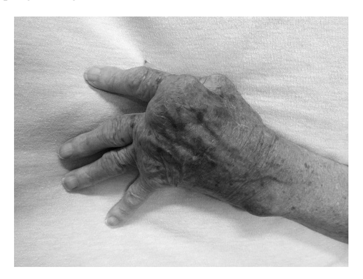
Osteoarthritis is a painful and disabling condition that can arise both from wear and tear of the joint and as a result of injury<sup>5</sup>

through a wall. They don't have to go through the wall; they only have to stick in the dartboard. In short, we would strongly discourage anyone from practising tameshiwari or undertaking the gruelling conditioning that is often associated with it. There are healthier and more effective ways of building confidence and developing strong and focussed strikes.